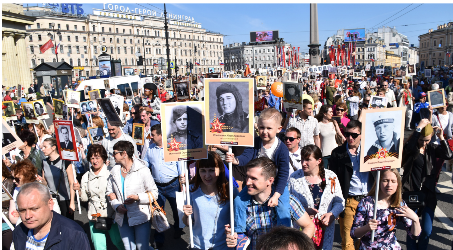
Launched as a local grassroots movement several years ago, today, Immortal Regiment marches bring together about over 8 million of Russian people across the country. Russian embassies and Kremlin-friendly NGOs also help organize Immortal Regiment processions in more than 60 countries around the world.

These organizations focus on an array of issues ranging from foreign affairs, international cooperation, and Russian diaspora to education, culture, religion, human rights to politics, history et al.