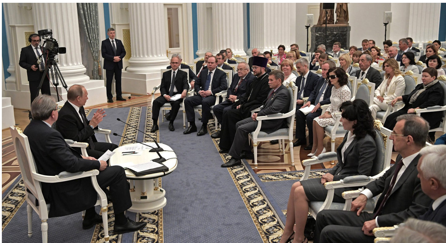
June 20, 2017: Vladimir Putin meets members of the Russian Civic Chamber in the Kremlin.