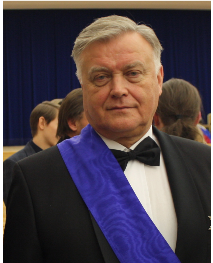
Former head of the Russian Railways Vladimir Yakunin currently chairs the Supervisory Board of the Dialogue of Civilizations Research Institute.

In 2006, there were 20 Russian and pro-Russian NGOs out of the total number of 324 third sector representatives among all the OSCE members. Three out of these 20 organizations were affiliated with the Russian government. It is remarkable that there were no organizations from the Baltics or from the CIS countries that would support pro-Kremlin agenda.