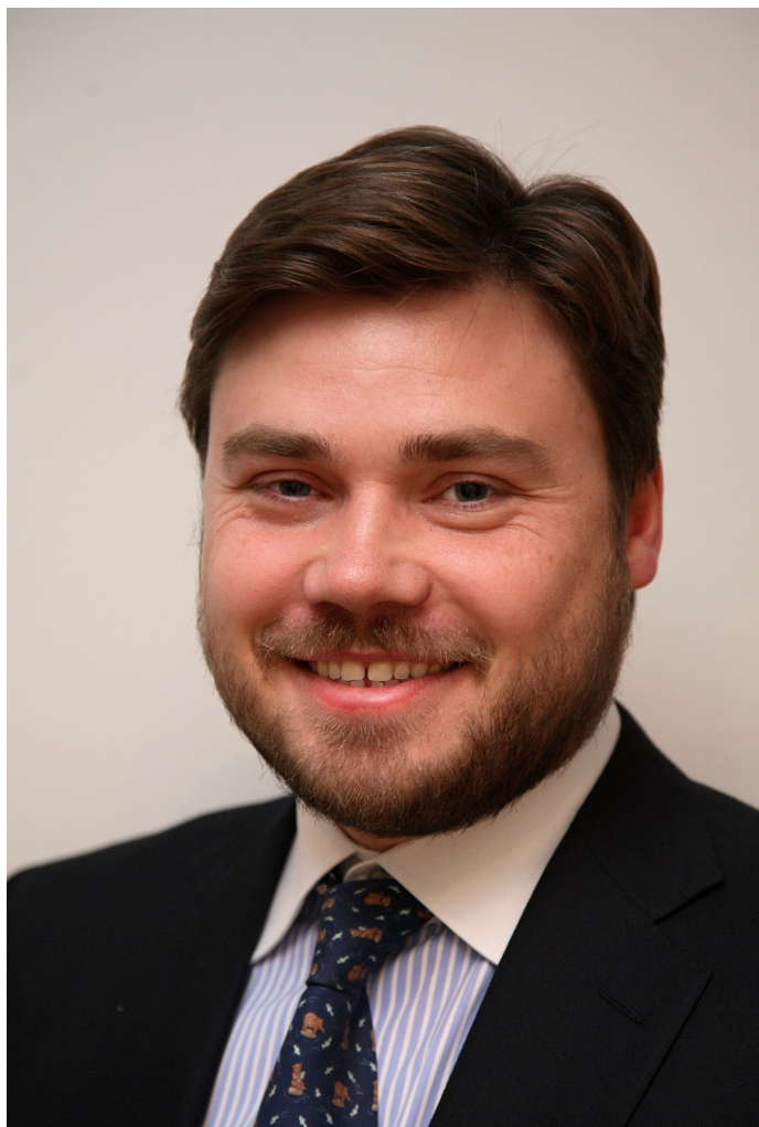
Founder of the international investment fund Marshall Capital Partners, Konstantin Malofeev chairs the board of directors of the Tsargrad media group; he is also Chairman of the St. Basil the Great Charitable Foundation.

Konstantin Malofeev, a Russian oligarch who has been exposed in the Western media as a supporter of the Europe’s ultranationalist movements, and Vladimir Yakunin are the key pro-Kremlin Orthodox philanthropists who fund several initiatives connected to the Russian Orthodox Church. They also lead special foundations seeking to spread Russian Orthodox values, such as the Center of the National Glory of Russia and the St. Basil the Great Foundation.