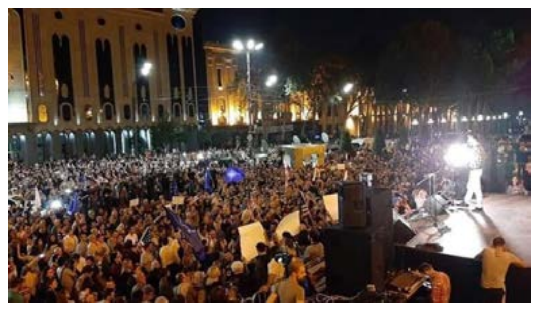
20th of September, 2019 by Nikolai Levshits

Seeking to quickly normalize the situation and disperse protests, the leader of the ruling party Bidzina Ivanishvili made a public promise to adopt constitutional changes and establish a proportional electoral system. Protests, however, continued with other demands.