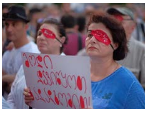
27th of June, 2019 by Nikolai Levshits

The June 20, 2019 visit by a Russian state delegation (headed Duma by а Member Gavrilov) to the Interparliamentary Assembly Orthodoxy in Tbilisi on opened a period of escalating political tensions in Georgia. Considering the fact that the Russian military forces have occupied Georgian territories since 2008, the reaction of the Georgian people to any state visit from Russia can be nothing other than negative. of soon as photos As Gavrilov hamming it up in the